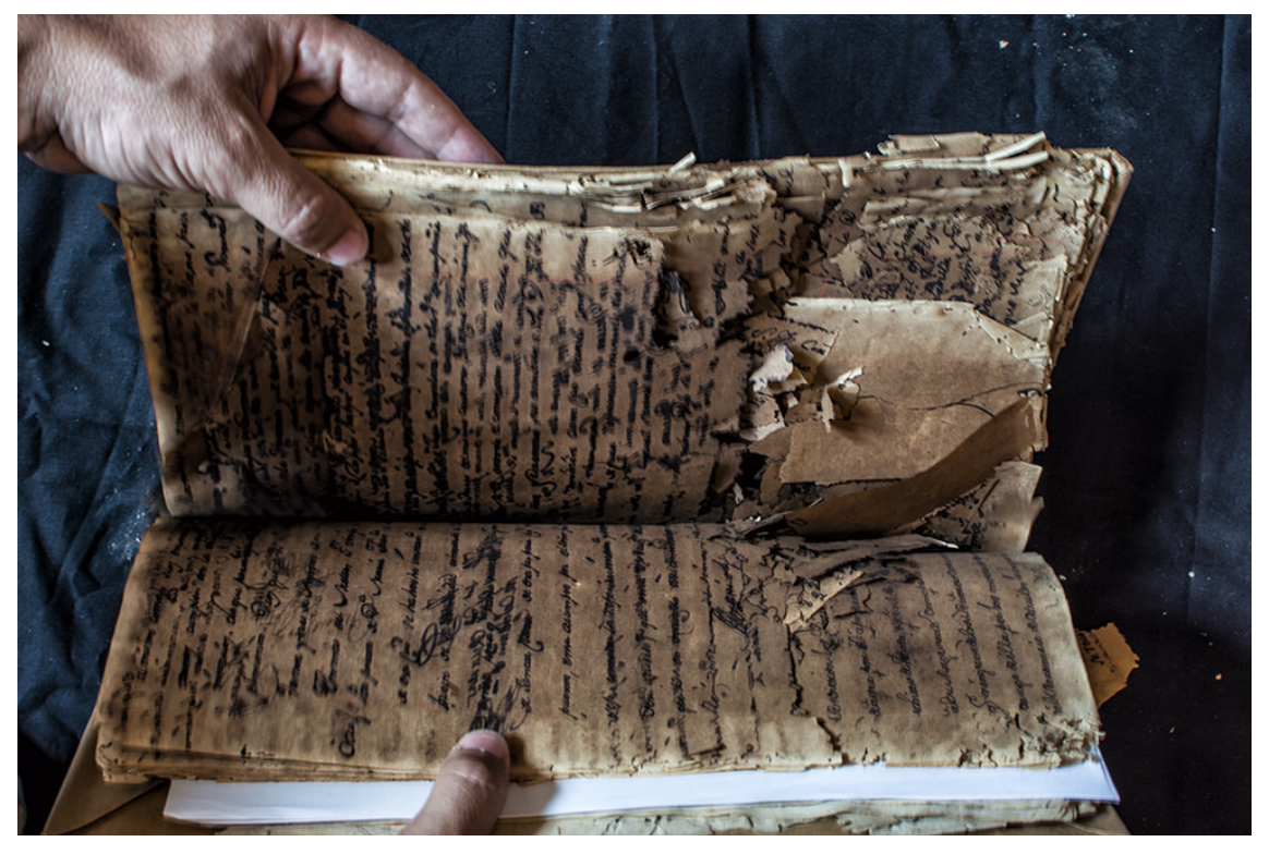
Figure 1.3 Insect-Damaged Manuscript

As the ESSSS digital archive expanded, it outgrew the initial infrastructure used to manage it. The ESSSS team had in the past, out of necessity, privileged locating and saving endangered information over digital curation. This is because of the specialized and difficult, and often dangerous, nature of rescuing these older documents, which become permanently inaccessible on a regular basis. For example, in the Chocóe region of Colombia, the ESSSS preservation team worked in an area known for being a refuge of the Revolutionary Armed Forces of Columbia. In Cuba, they often labored without consistent access to electricity and running water. One of the collections the ESSSS team digitized went missing from the church where it had been stored, so now the ESSSS photographs are all that remains of the historic record of Africans in the region. Some of the churches, which served plantations in the early modern era, are in locations that are difficult to access or in places vulnerable to climate change: some document collections have been damaged from insect swarms and flooding, for example. Each day these records disappear from churches, and it is a race against time to collect and preserve these early and rare primary sources for African history in the Caribbean and wider Atlantic world.