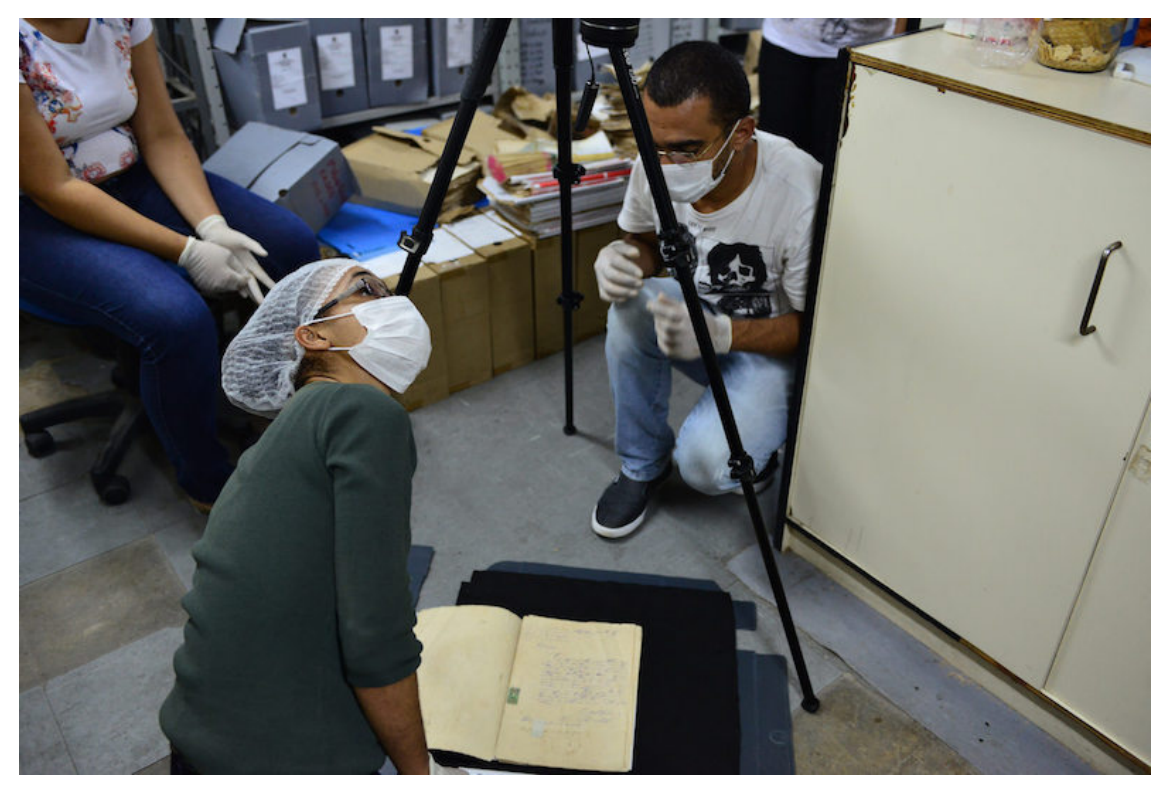
Figure 1.5 Digitization Training

imported at different times. Fortunately, the ESSSS teams also retained the original file names in the database; in the future these can be catalogued both ways while preserving each image's metadata.