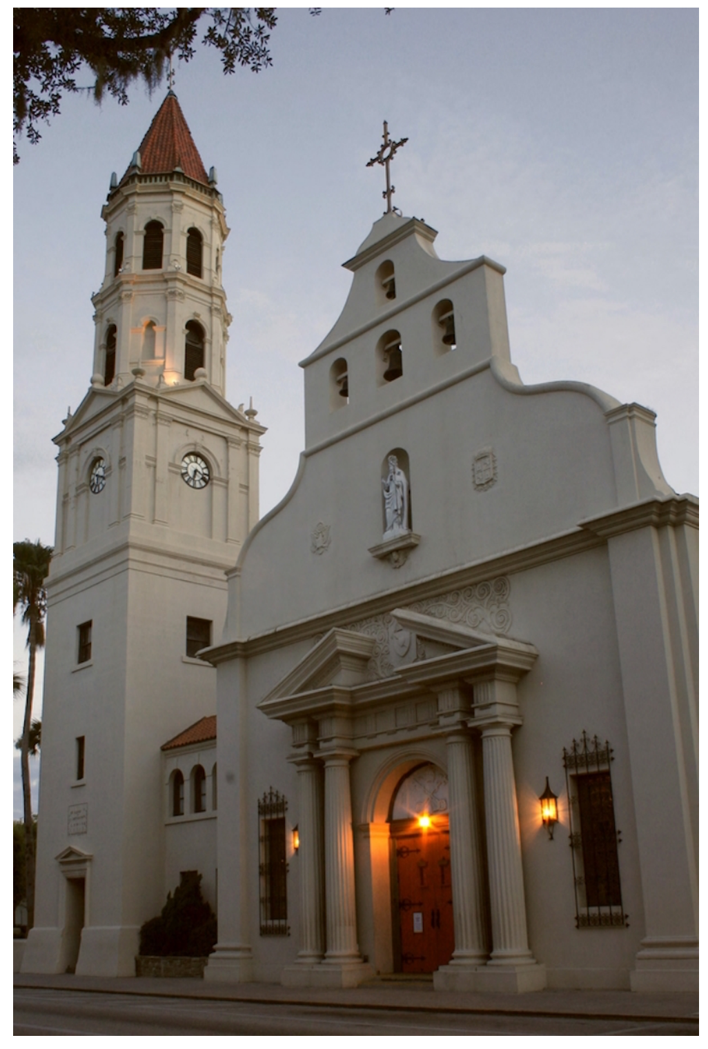
Figure 1.2 Cathedral Basilica of St. Augustine, St. Augustine, Florida