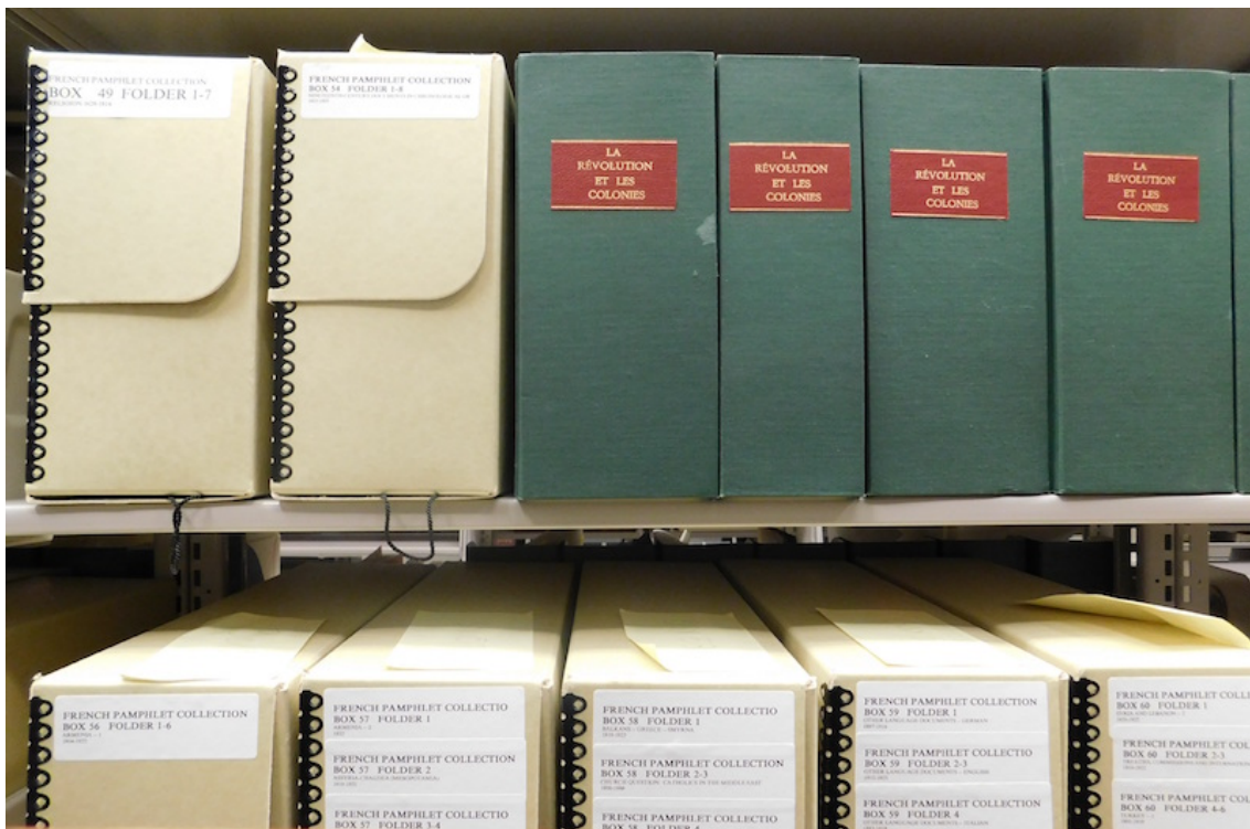
Figure 1.1 French Pamphlet Storage Boxes

The University of Maryland (UMD) Libraries' Special Collections holds nearly ten thousand French pamphlets, dating from the seventeenth through the twentieth centuries. Many of the French pamphlets were stored in boxes according to subject; perhaps they arrived in College Park in said boxes, or perhaps this system was implemented during earlier attempts to catalogue this collection. Regardless, while the pamphlets focusing on mainland France were organized thematically in uniform boxes, those focusing on the French colonies had been preserved in separate boxes, distinct from the rest of the collection.